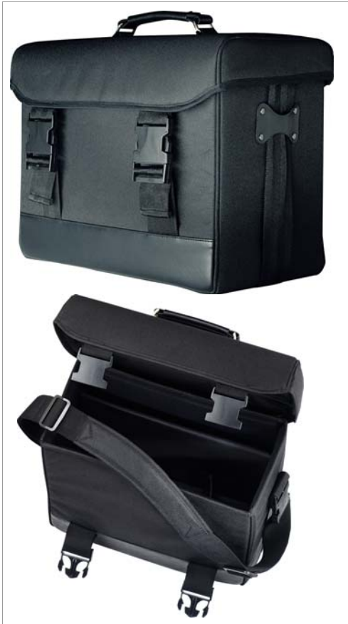
Universal carrying pouch F2000 (Z700D)

Outside dimensions: W x H x D 380 x 310 x 200 mm (without buckles, handle and carrying strap)