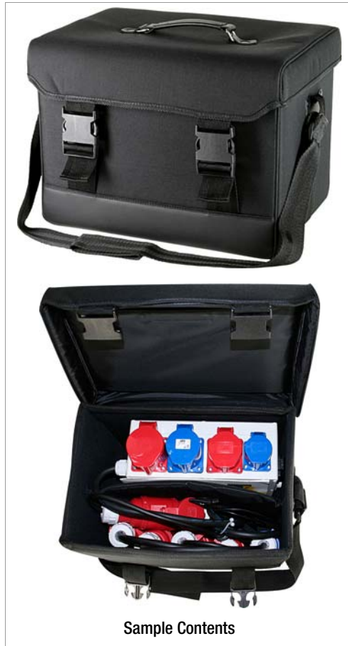
Universal carrying pouch (large) F2020 (Z700F)

Outside dimensions: W x H x D 430 x 310 x 300 mm (without buckles, handle and carrying strap)