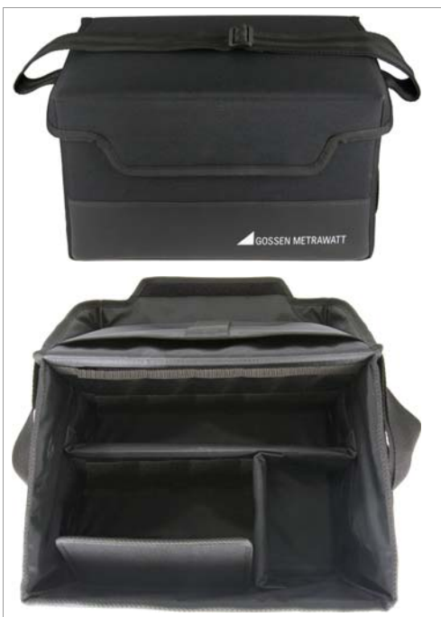
Universal carrying pouch (small) F2010 (Z700G)

Outside dimensions: W x H x D 380 x 230 x 270 mm (without carrying strap)