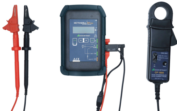
Figure 2: Battery tester with AC/DC current clamp sensor CP1800 (Z204A)