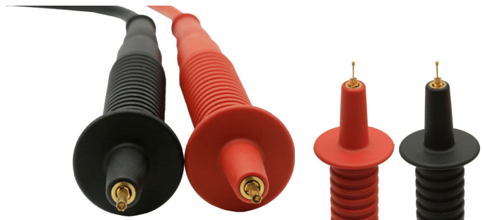
Figure 4: Kelvin probes with spring-loaded contact pins