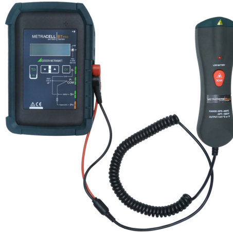
Figure 3: Battery tester with temperature sensor METRATHERM IR BASE (Z680A)